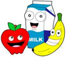
Table Manners at Westside